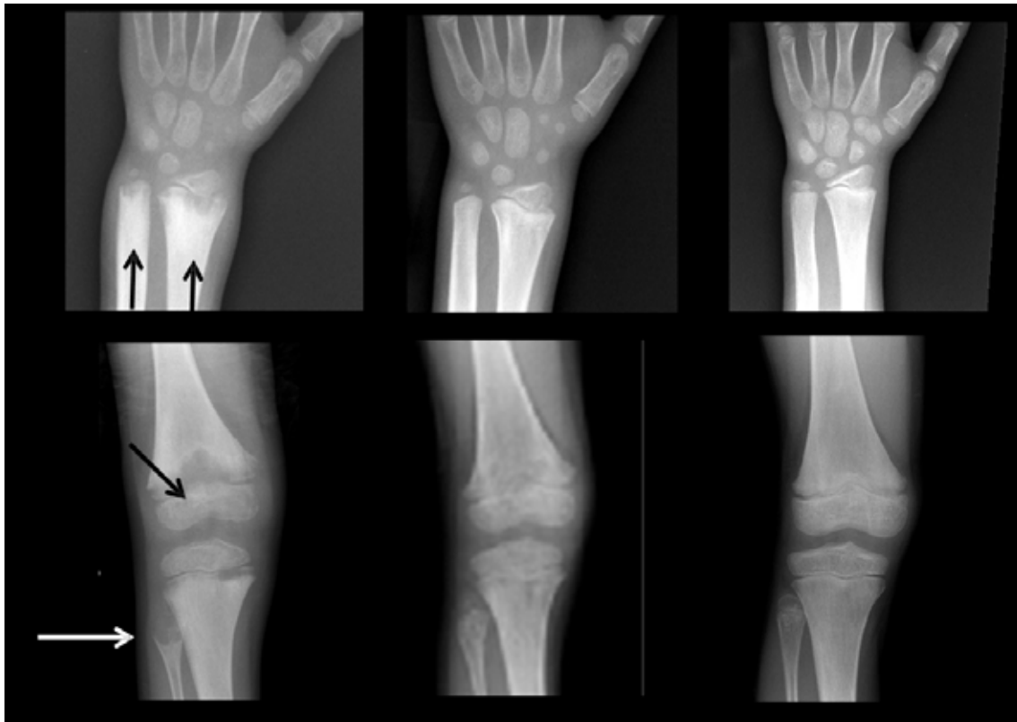
Figure 3. X ray of left wrist and knee film (baseline) (left) compared with film at 6 months (centre) and 36 months (right)

Asfotase alfa is, with some qualifications (see below), an effective therapy for skeletal involvement of young patients with HPP. The evidence for clinical efficacy in selected patients is very strong. A regimen of 1 mg/kg 6 times per week or 2 mg/kg 3 times per week, normalises mineral chemistry, increases whole body mineral content and results in radiographic evidence of healing rickets. This is true across the age groups from the perinatal period (those surviving the newborn period) through infantile and juvenile presentations.